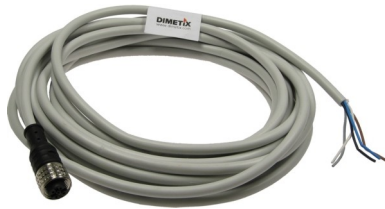
Cable to connect the EDS Distance Laser Sensor.